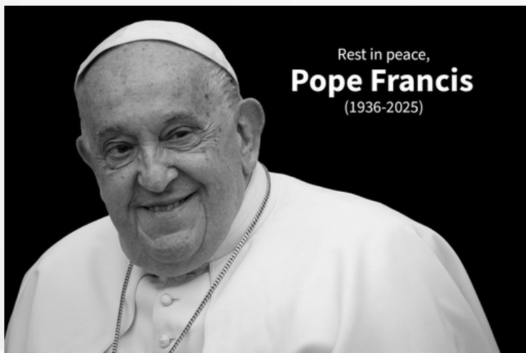
Rest in peace, Pope Francis (1936-2025)