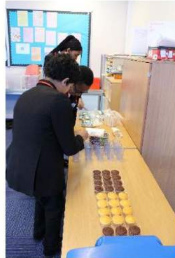
Hello from the Headteacher