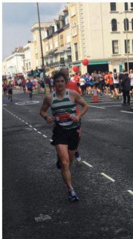
Photo of marathon below, going well at 18 mile point.