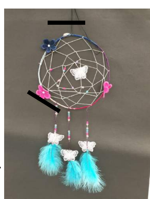
THE GARDEN PROJECT IS WELL UNDER WAY. YEAR 8S ARE TASKED WITH MAKING A WIND CHIME, DREAM CATCHER OR HANGING ORNAMENT ALL FROM RECYCLED OR UP-CYCLED MATERIALS. THEY ARE LOOKING FAB!