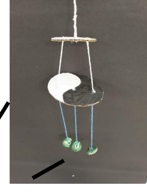
YEAR 8 Product