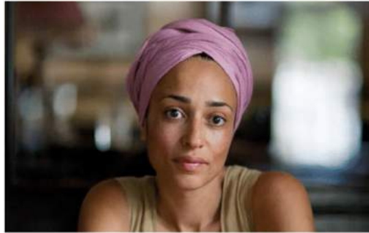
Zadie Smith - Novelist and Poet