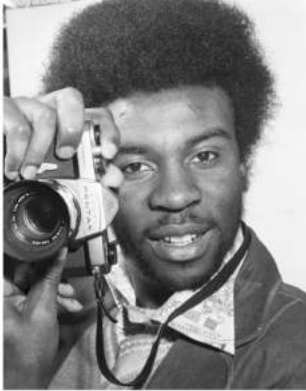
Neil Kenlock - photographer