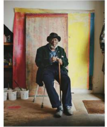
Frank Bowling - Artist