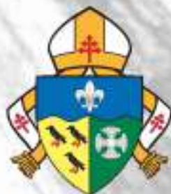
Diocese of Southwark

The Chaplaincies and Justice and Peace Commissions of