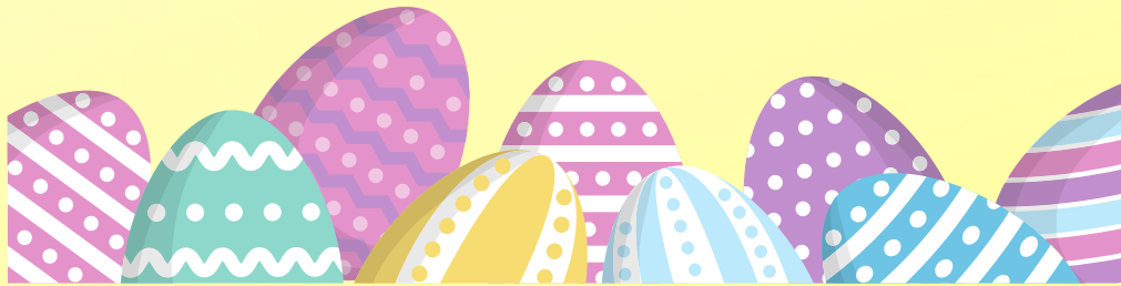
Easter Egg Donations