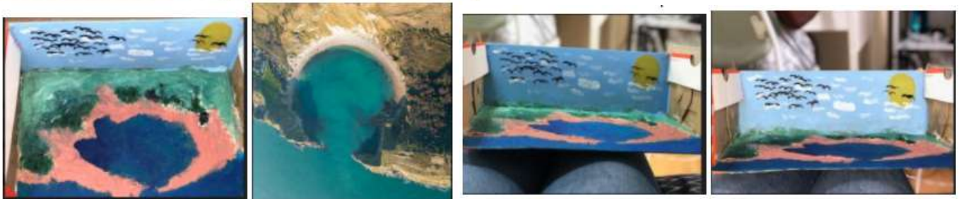
Lulworth Cove