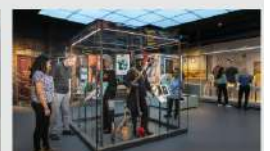
PERMANENT DISPLAY Second World War Galleries IWM London Permanent