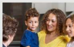
FOR FAMILIES We Were There Family Days IWM London IWM London Every Tuesday, 26 July - 30 August