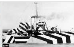
FOR FAMILIES The Dazzle Design Studio IWM London IWM London 26 July to 29 August