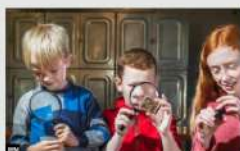
FOR FAMILIES The Camouflage Unit Camp IWM London IWM London Friday 6 in August