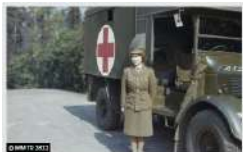
ACTIVITIES & EXPERIENCES, EXHIBITIONS & INSTALLATIONS The Queen's Platinum Jubilee at IWM London IWM London 27 May 2022 to 8 January 2023