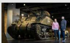
PERMANENT DISPLAY Turning Points: 1934 - 1945 IWM London Permanent