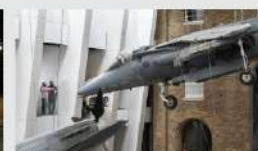
PERMANENT DISPLAY Witnesses to War IWM London Permanent