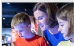
FOR FAMILIES Story Seekers: Camouflage & Disguise IWM London IWM London 26 July to 29 August