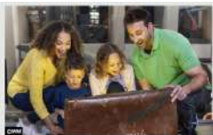
FOR FAMILIES Story Seekers IWM London - weekends IWM London 11 June to 17 July 2022