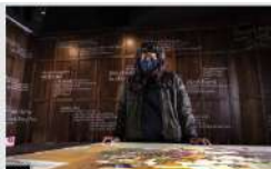
PERMANENT DISPLAY First World War Galleries IWM London Permanent