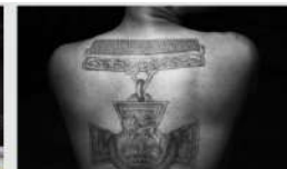
PERMANENT DISPLAY Lord Ashcroft Gallery: Extraordinary Heroes IWM London Permanent