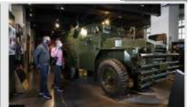
PERMANENT DISPLAY Peace and Security: 1945 - 2015 IWM London Permanent